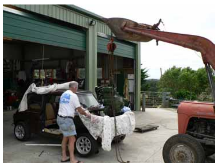
The new engine navigated in position

When I got back, everything was in place and the system ready to bleed. A couple of pumps on the pedal each side and with the bleeders locked off, a perfect pedal resulted! All that drama, just because of a simple mistake - that's one I won't forget in a hurry!