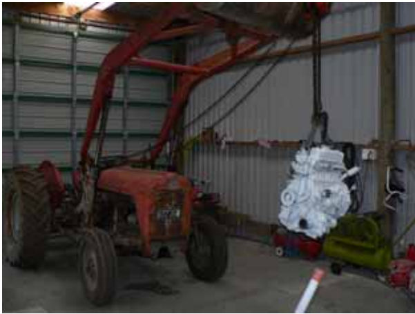
Another motor then ...

Off to Kihikihi with a trailer and the deal was done. What we got was 1980 Mini with a bright red 1275 engine that wasn't running. At that price it was worth the gamble. Out with the tractor again and out came the engine. The car had 2 radiators fitted, an extra large one in front, and pipes running thru the car to another in the boot. Odd we thought! The motor was cleaned down and a few basic checks carried out. Taking off the thermostat housing revealed the thermostat fitted upside down. Could this be the reason for the 2 radiators?!?. On went the parts from the original engine, carbs, exhaust, radiator etc and the motor was fired up on the floor. The motor ran ok but a peep underneath revealed a serious oil leak in the front timing cover seal! Umm - beginning to have doubts about this engine at this stage. Off with the timing cover and an inspection revealed a worn seal, broken timing chain tensioner and the cam timing was a tooth out! About this time confidence in this engine was getting pretty low. What were we to do? With not many options press on was the call. A scrounge around located another tensioner. The timing was corrected, a new seal, gasket, plenty of sealer and everything was put back to-