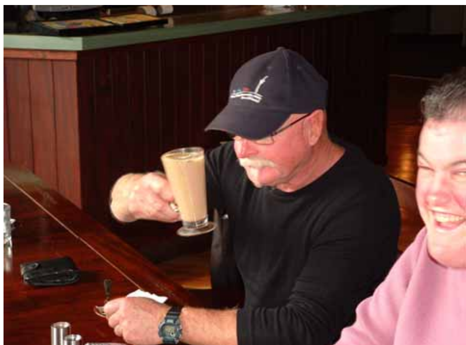
What's that Handy ? – cheers to you too !