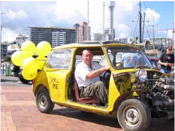
Ian in Pork Pie

Being an Aussie MK2 Cooper S there were some parts matching challenges, but my finely honed skills from decades of Minis stood me in good stead and the only part I ended up with that didn't fit was used in a later project.