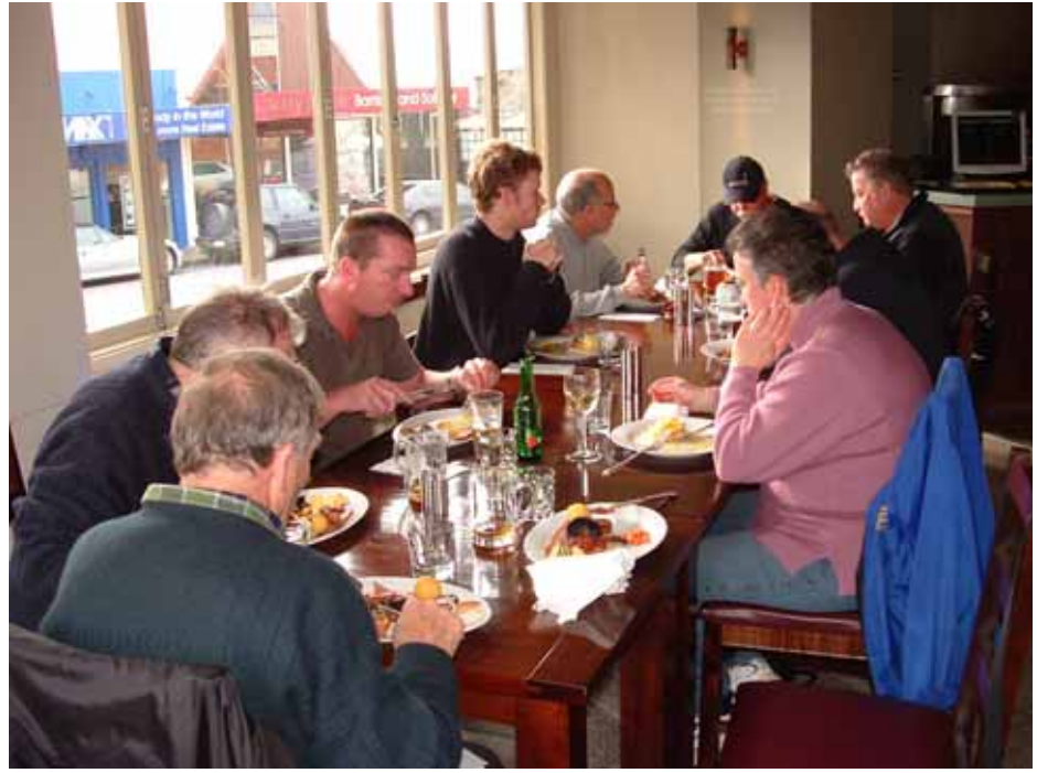
Lunch at Prospect Bar and Restaurant

For those who couldn't make the Technical morning, you missed an excellent club outing. The morning was well organised and a credit to those involved.