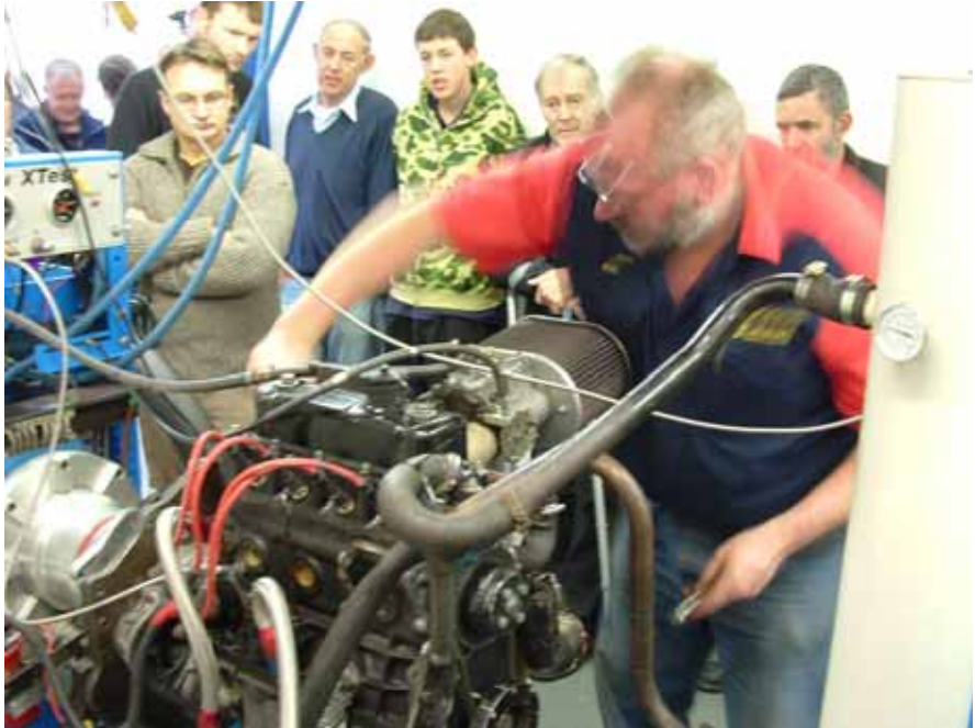
Setting a race engine up on the Dyno