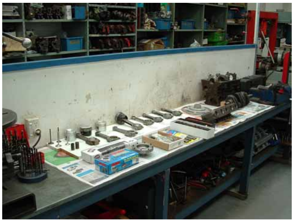
Mmmmm – the wish list !