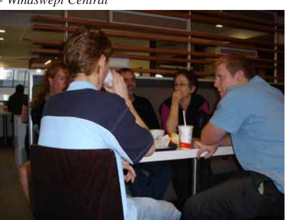
The Finish - we love Big Maccas