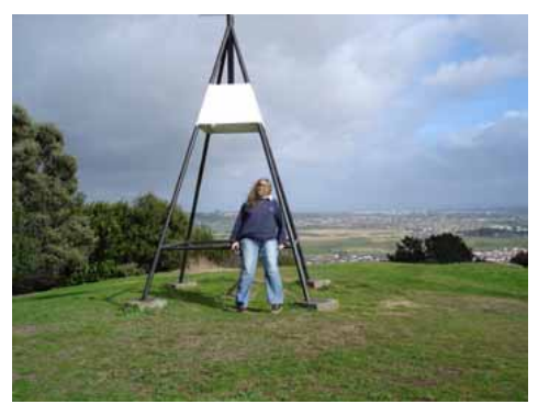
Point View Reserve.

Was this to be the shortest? Would 3 hours be enough time or too much to coast to victory? There would be a lot of old memories from these places so maybe these would be the winner on the day.