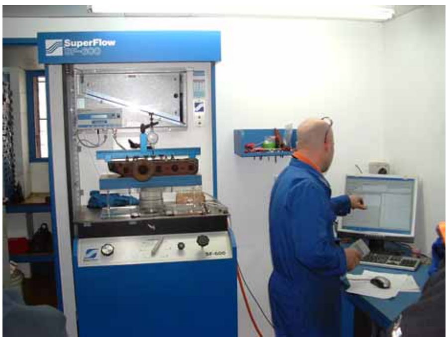
Flow testing a Mini head