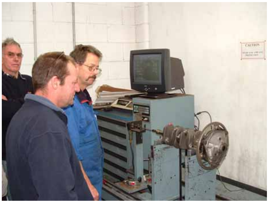
Balancing a Mini crankshaft & flywheel