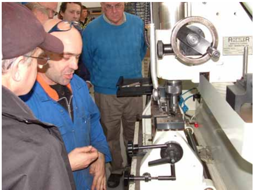
Machining a Mini head