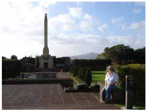
Bastion Point and Savage Memorial

Our route was to be, Point View Reserve - Botany Downs(we didn't know it existed!), Stockade Hill - Howick (venue of many a teenage Friday Night many moons ago), Musick Point - Buckland's Beach(driving through the Golf Club en route reminded me of many a mistimed drive with 100 ft cliffs on each side!), Mt Wellington - Panmure (I remember the annual King of the Mountain races and thought they were mad), Bastion Point - Orakei ( looking out over the harbour where many hours were spent yacht racing), Auckland Domain - Grafton (scene of many a hard fought cricket match), Mt Eden - you know where (where we watched the T. College after a bomb scare once, waiting for the explosion and the subsequent enforced, paid holiday), Cornwall Park - Epsom (anybody remember lunchtime runs through the park?) and finally Mt Richmond - Otahuhu (where Gary and Catherine would exact their vengeful toll on us who have had a few more birthdays than others!) and finally onto Manukau to the finish and a welcome coffee stop.