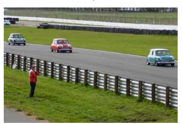
On the track