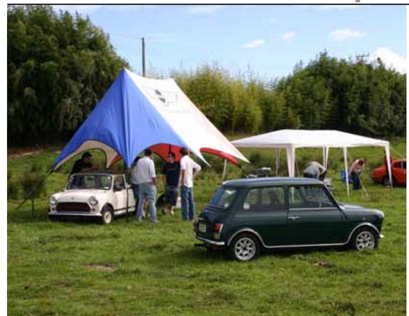
Our corner is getting set up.