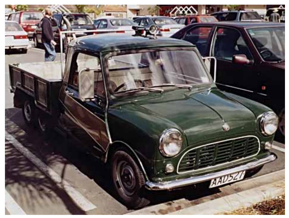
Mini Truck. Note the double axle and high exhaust.