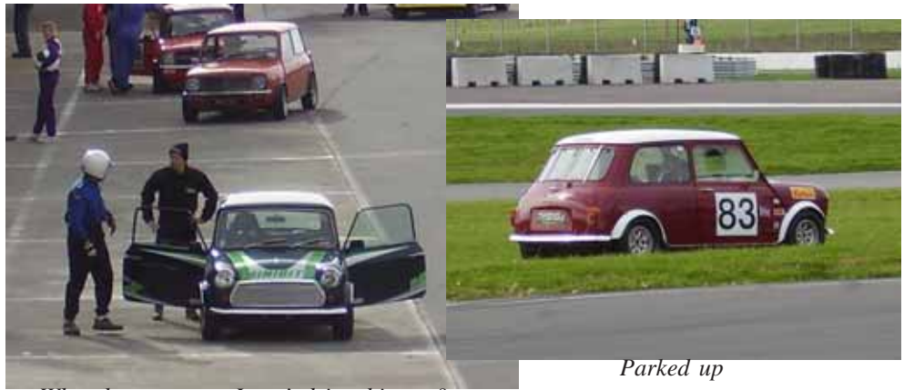
What do you mean, I can't drive this one?