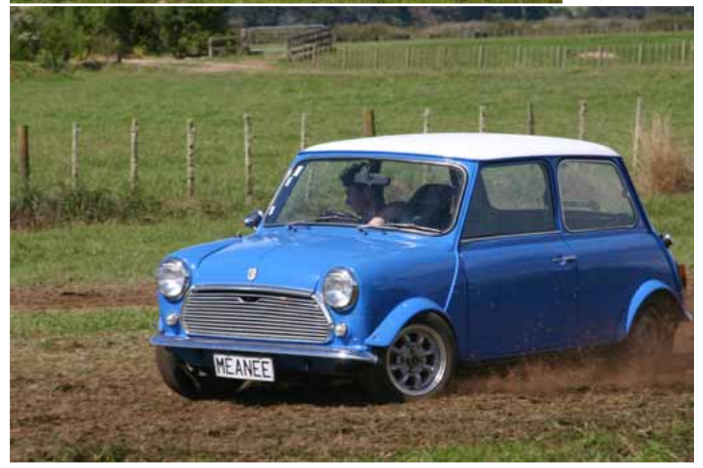
Meanee plowing the paddock.