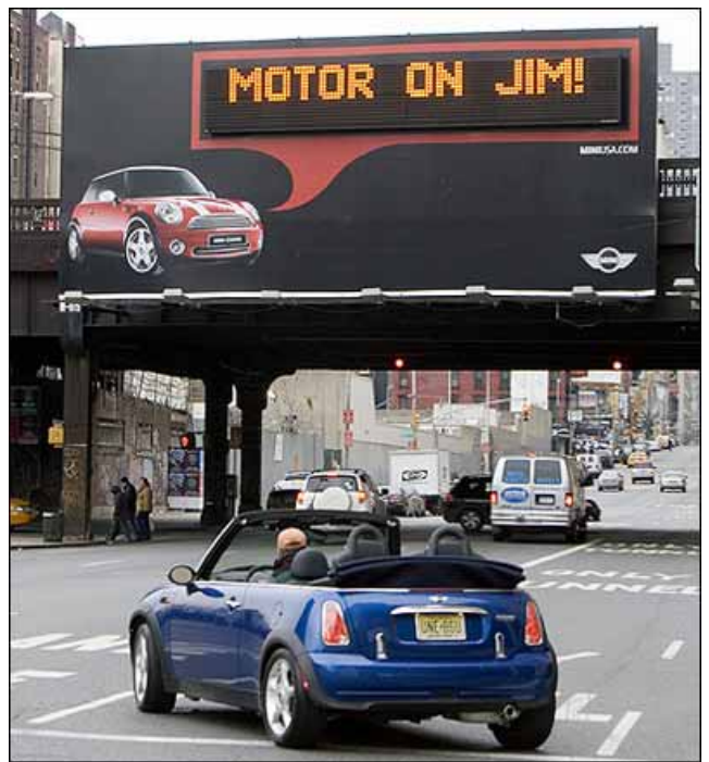
A Mini drives past a billboard using RFID technology during testing in New York.

Jan. 29, 2007—Ever since BMW subsidiary Mini USA brought the updated, sporty Mini Cooper to U.S. motorists in 2001, the wee car has been turning heads and