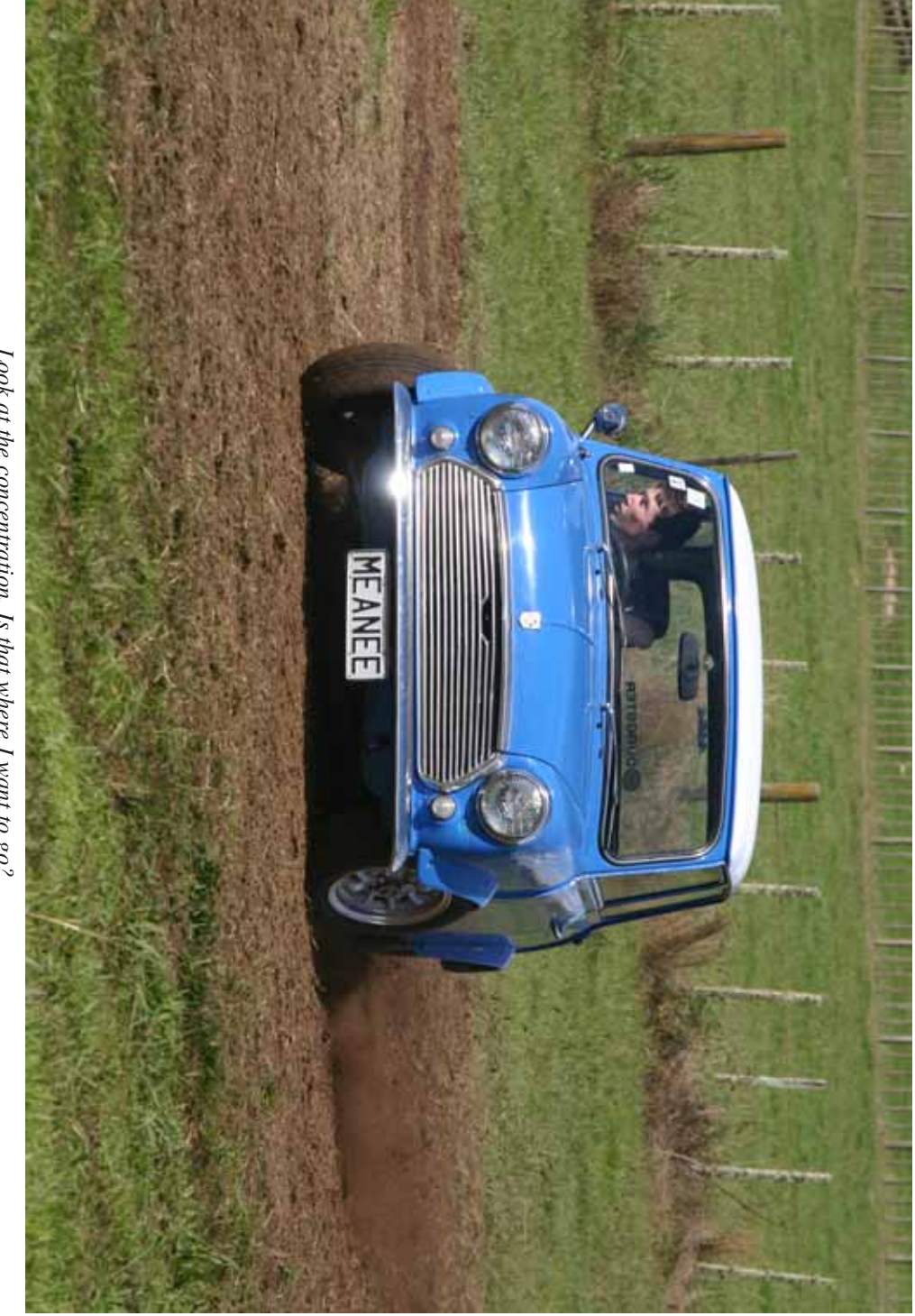
Look at the concentration. Is that where I want to go?