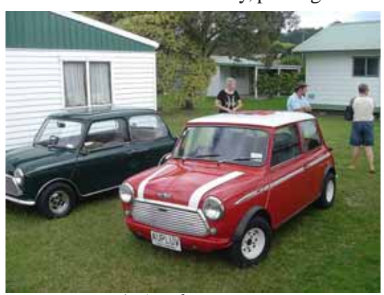
A nice place to stay.

A group traveled on Friday morning to clear a path set by severe storms and flood waters. You remember the Northland floods late March – well this was the tail end lash out at New Zealand before departing for the Southern Ocean. A group of seasoned and mature travelers found Saturday morning after early coffee a more sensible start time. This group traveled in convoy, passing the ice