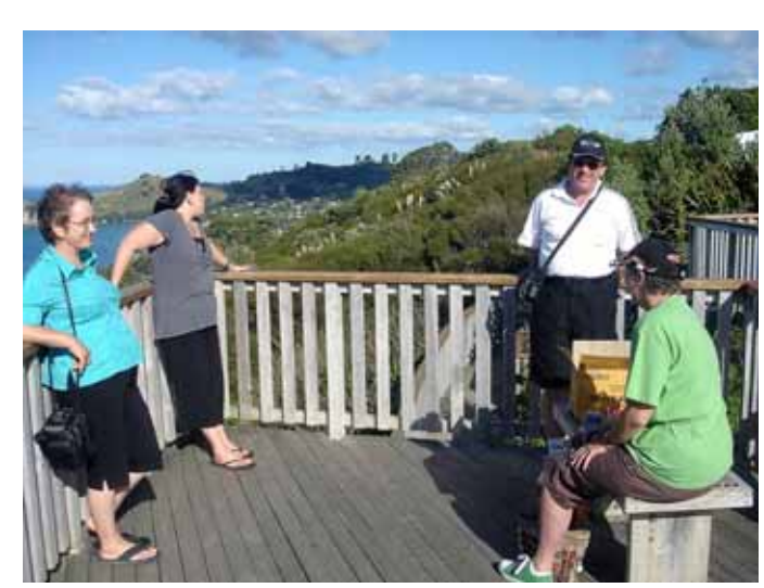
What a relaxed day it was

Don't mention Lees Road – a place of discovery and frustration with cars being miss led by a green mini into mayhem! It's like a black hole unsealed road eventually turning into a rabbet track and few cars ever return from there.