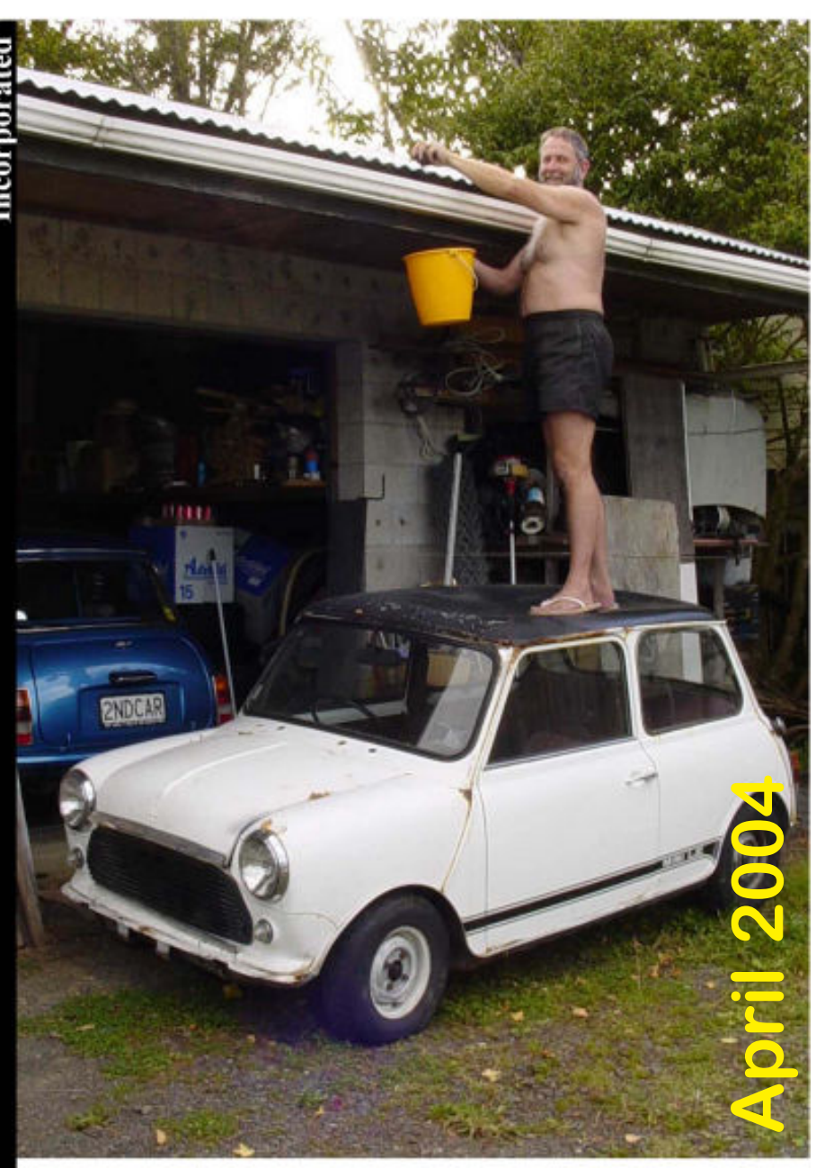
But I still want that extra Mini... I do use it...