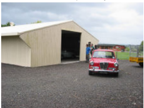
As you can see, it's not small.

You've all heard it. Our club has stroage space available for a reasonable price. I don't know the very fine details of it but I can show you some pictures about the storage site and the space inside.