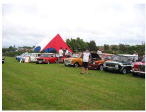
Lots of Minis

At 9.00am we all drove in and set up the cars under the new tent. This has turned out to be an excellent addition to the club giving us somewhere to shelter from the sun and the odd raindrop. For those that went last year it was also going to be useful to keep off the soot from passing steam trains! Once set up there is ample room for a couple of picnic tables, chairs and the BBQ. If you haven't seen the tent let me tell you it has 3 main panels per side, each one being red, white or blue. It was decided to put cars of corresponding colours under each section with the remainder set in two rows to the side. The display