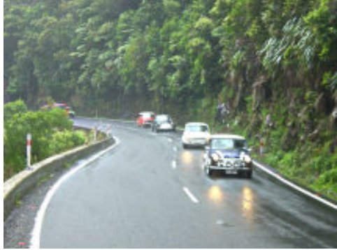
Coming throught the gorge.

Anyway, we headed up to the Spa Bath Park for a photo shoot then headed for Paeroa for another photo in front of the L&P bottle.