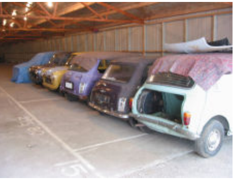
There are actually already a fair few Minis parked up inside the shed.