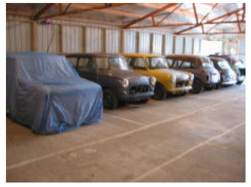
Secret Minis under cover, half finished Minis, dented Minis, purple mini, All sorts of Minis. looking at the parking lots, this is designed for Minis.