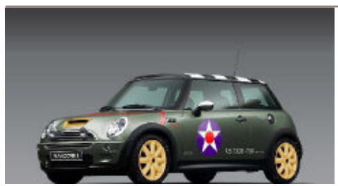
Ike's Jeepers-creepers Hummer special

Yes, hot on the heels after MC40 celebrated the 40 years anniversary of the Monte Carlo Rally – new model DD60 celebrates 60 years since D Day with this strictly restricted special offer - UK price will be around £19,5k and the inside has got to be seen to be believed with stainless steel floor pan, and polished alloy facia (only got outside pictures sorry). Only available in UK and USA markets from Ike's Surplus Stores