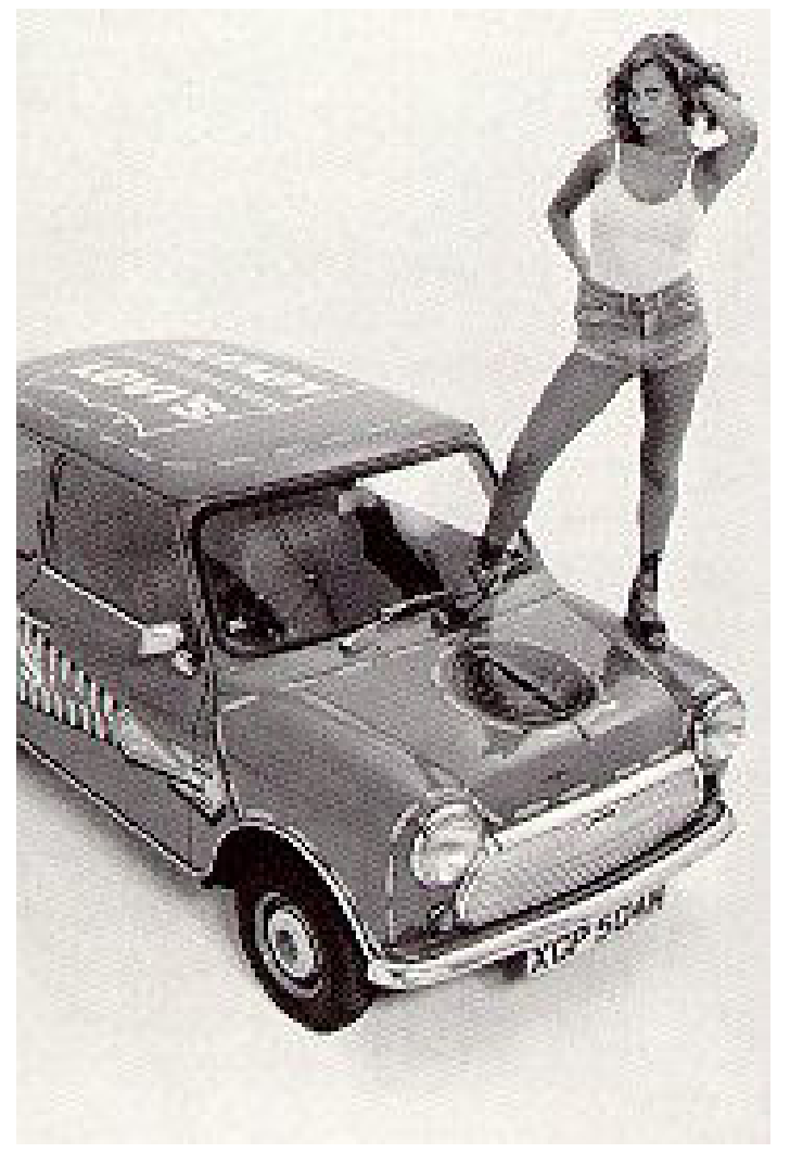
August / September 1997